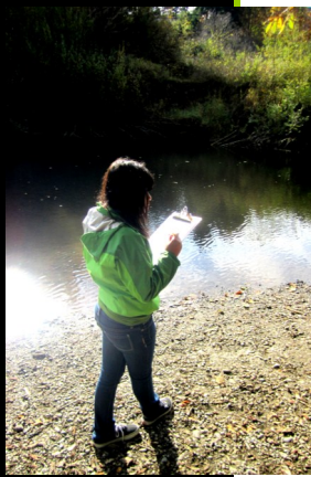
Komachin student records water quality monitoring data.